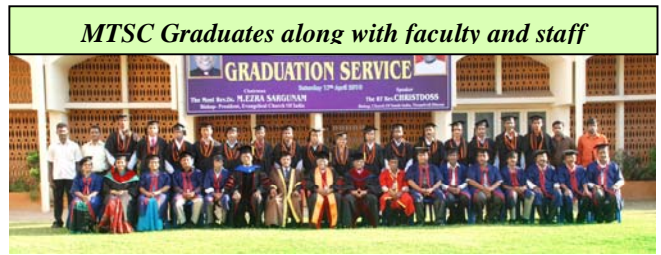
MTSC Graduates along with faculty and staff