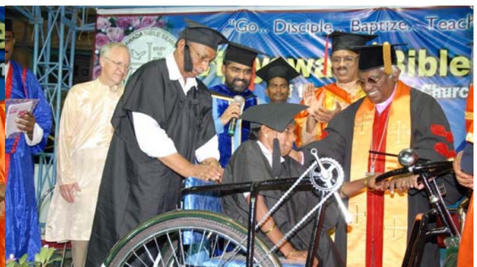
Tricycle provided to one of the graduates