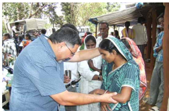
Praying for the people in need

The opportunities to present the Gospel or to teach the Word were numerous and I found myself waking in the early hours of the morning inspired with a Word from heaven. What really stood out to me was the courage and depth of the congregations I spoke to, whether in the noisy cities bustling with activity, or in the quiet villages often without constant electricity or light. There was a great Christ-likeness that was wonderful to see, a determination in the heart of Indian Christians to follow Jesus with enthusiasm. This was something that I could not have read in a book or heard from a preacher, it was something I had to experience first hand.