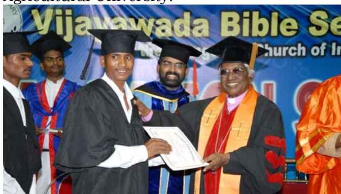
A Seminary student receives his certificate