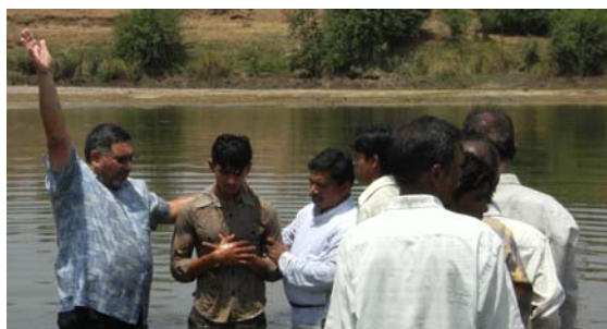
Baptising the recent converts

My time in India involved meeting many wonderful men and women of God, enjoying some new tastes and experiencing the power and anointing of God in fresh new ways. From helping to baptize 54 people in the river in Gujarat one day and another 14 the next, to praying over oil filled bottles that were to be used to anoint the sick in the villages, each day brought a new exciting challenge to see God move in amazing ways.