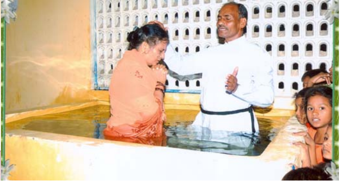
16 people were baptised at ECI MGR Nagar Church by Rev Paulraj