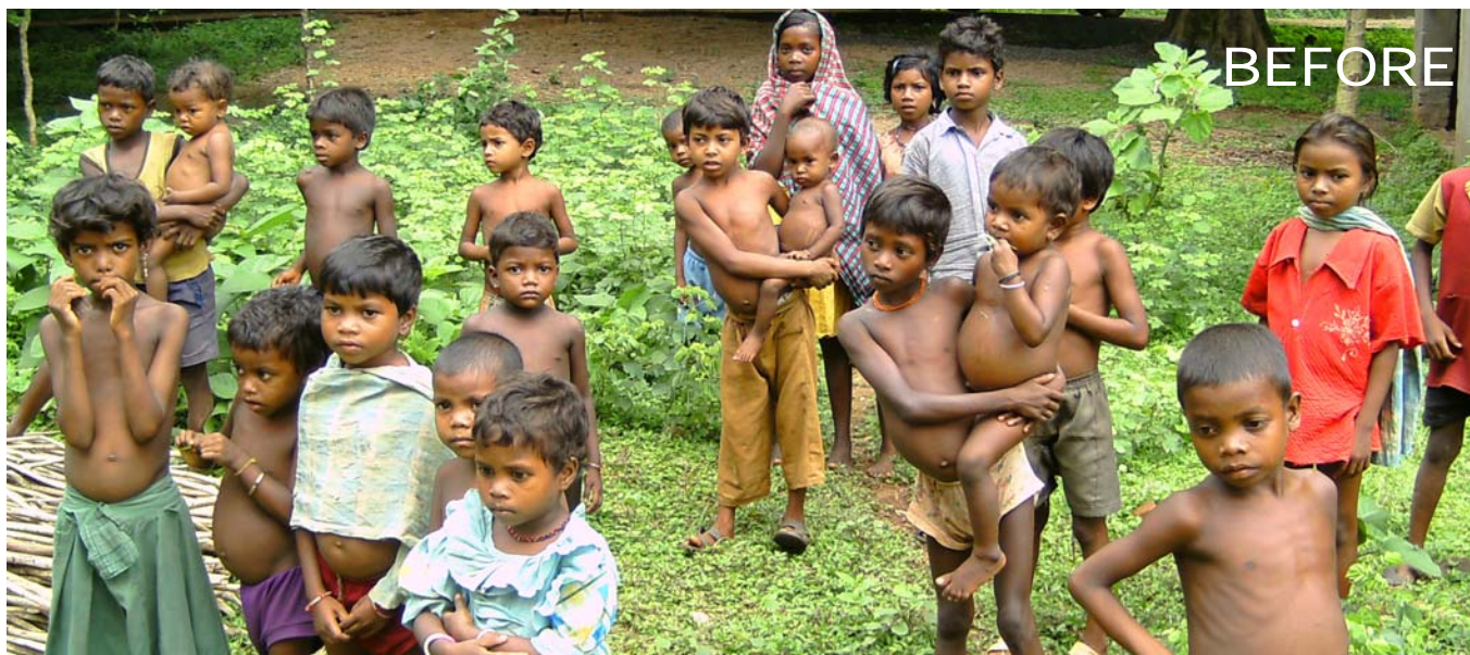
Malto Tribal children in Jharkhand before and now

Of all the Indigenous Mission Organisations, Friends Missionary Prayer Band missionaries are in the front line. They took the Gospel to the Malto in Jharkhand, one of the diminishing tribes in India. God worked miracles and many churches have been established among the Malto through them. On 29 th of October 2005 FMPB handed over 441 churches to Evangelical Church of India. From then on, ECI is actively involved in constructing church buildings, establishing new churches, training the local pastors and also assisting the people through tailoring school for women and English medium school for the Malto tribal children.