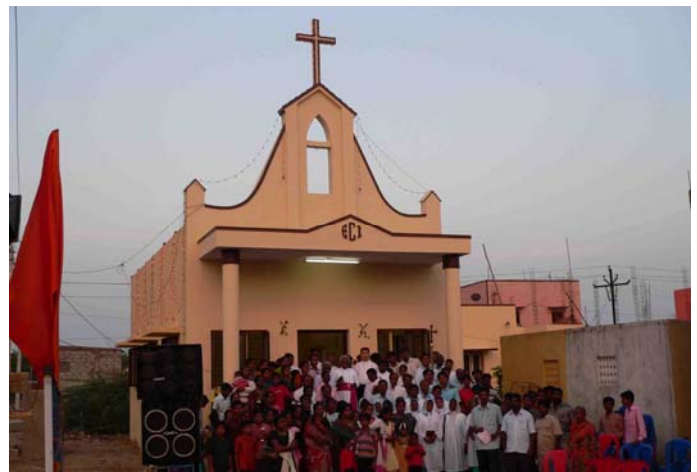
ECI Kelambakkam Church