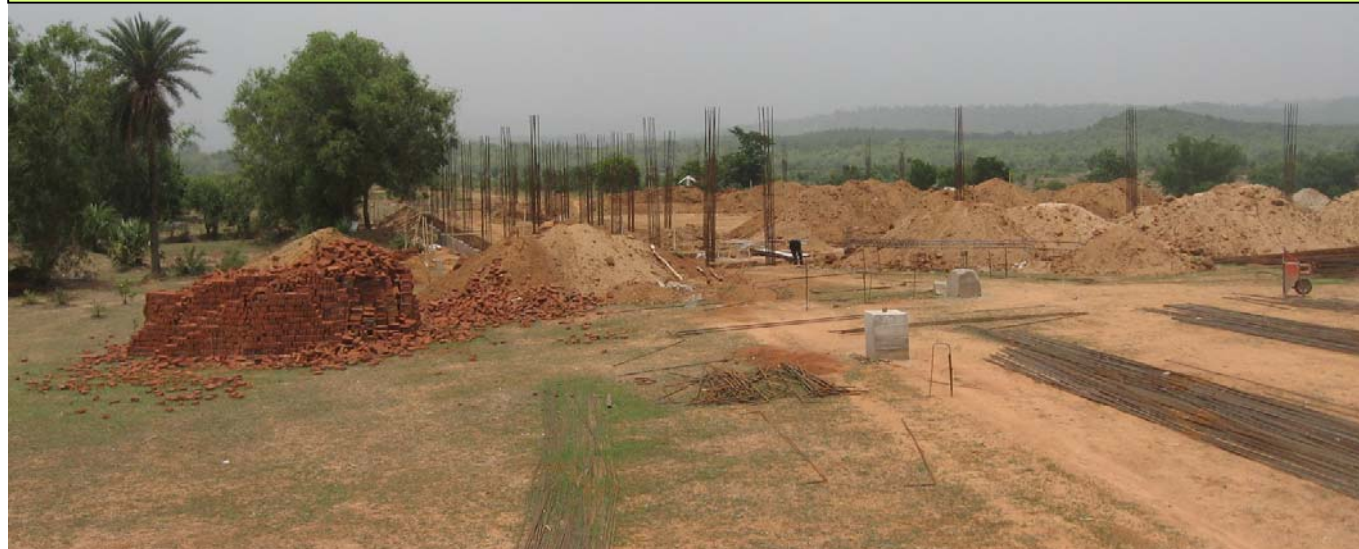
Construction works commenced toward the ECI Mission School building for the Malto children