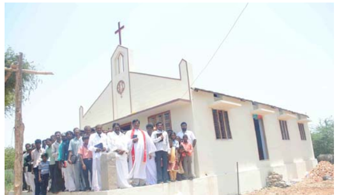
ECI Bommalapuram Church