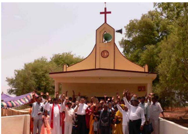
ECI Burujupalle Church