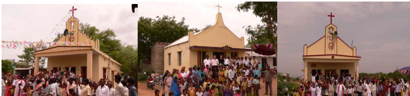
ECI Ekunampet, Badaveedu and Chapadu churches dedicated in Andhra Pradesh