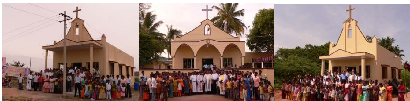
ECI Ariyalur, Marutham nagar and Nachiyarpet churches dedicated in Tamilnadu